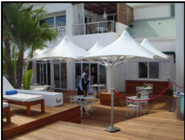
Fabric : Ferrari 402®