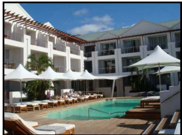
Fabricator : Cape Shade