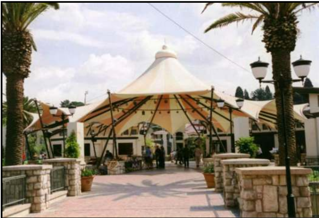
Fabric : Ferrari 1002 T2®

A multi function entertainment area needed to be covered at the Randburg Waterfront in Johannesburg. The architect wanted to maintain an easy flow of foot traffic through the area.