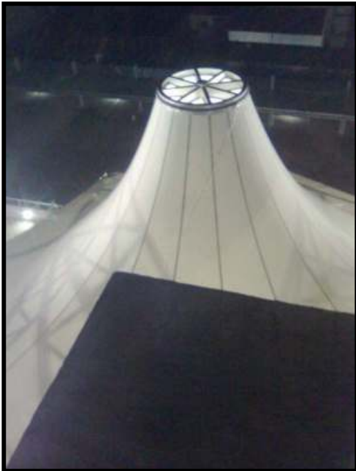
Fabric : Ferrari 902S®

The client, Hollard Insurance wanted an outside covered structure for their new coffee shop. The structure needed to be a feature piece due to the buildings straight lines and prominent positioning in Maputo.