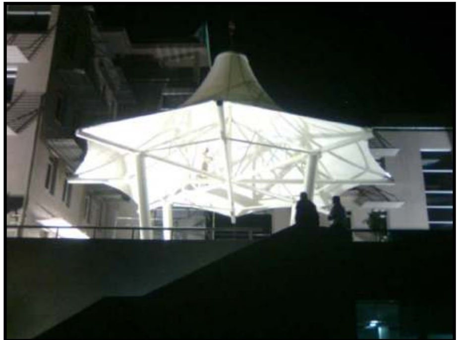
Fabricator : Texwise