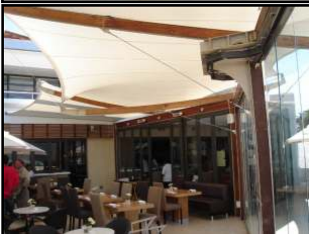
Fabric : Ferrari 502S®