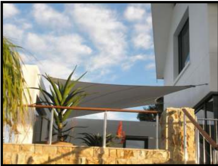
Fabric : Ferrari Soltis 92® Shade Sail

The challenge was to provide shade for this sunny alcove between two buildings. The owner required a simple, inexpensive solution which would make the area habitable on warm, sunny days and allow the owners to enjoy an unobstructed view.