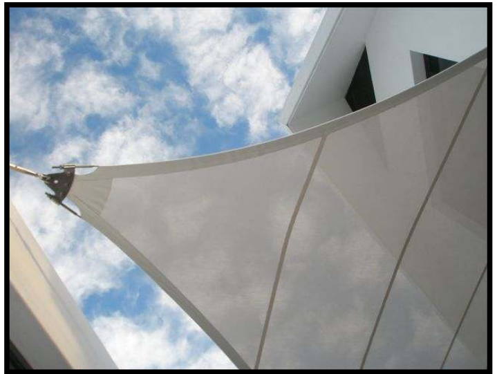
Fabricator : Genoa industries