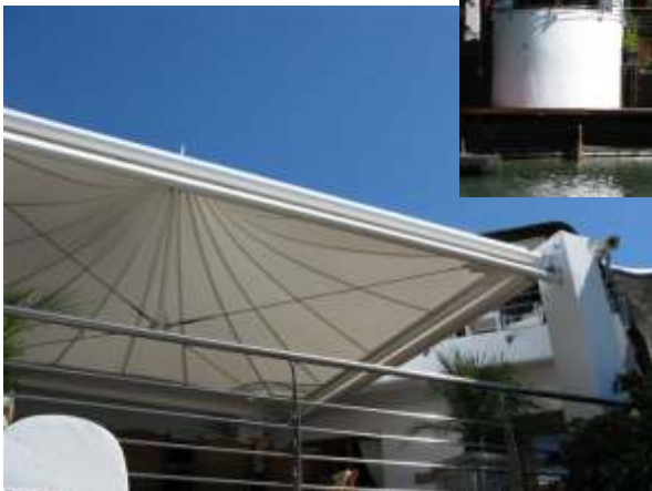
Fabric : Ferrari 702S®