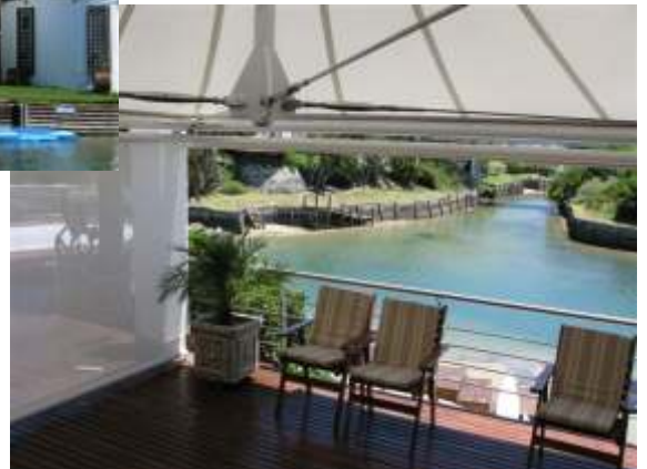
Fabricator : Genoa industries